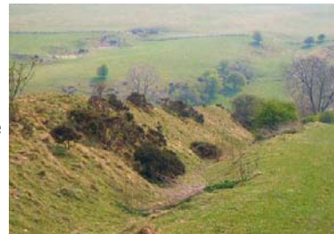
Offa's Dyke—magnificent ancient earth work,

A fabulous upland walk—each day you will wake with eager anticipation of what beautiful landscape is ahead of you.