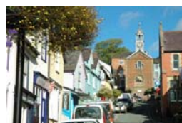
Bishops Castle—a throw back in time -a proper border market town

5. Caer Caradoc, Hope Bowdler Hill, Cardington, Wilstone Hill,