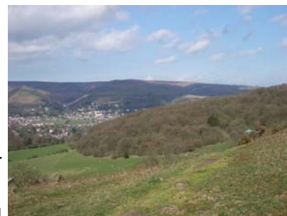
Shropshire's rolling countryside

We also have a packed lunch service, freshly made each day, to a choice from our packed lunch menu.